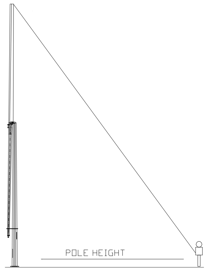
Figure 2: Step 7