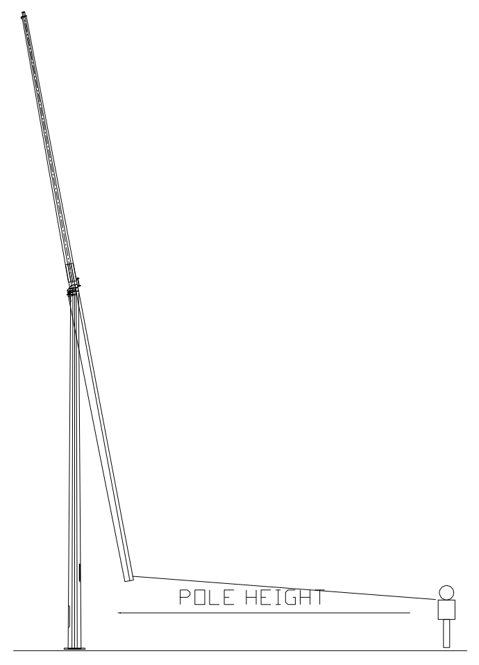
Figure 3: Step 9